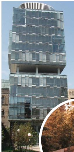
Gleaming: the new Donnelly Centre.

Other companies with a major presence in Toronto include Apotex, GlaxoSmithKline, AstraZeneca and Eli Lilly. The pharmaceutical industry as a whole employs about 10,000 people in the Toronto region, mostly in